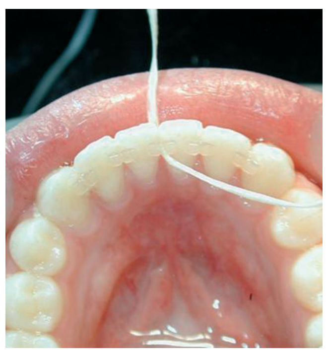
Figure 5 The LingLock^{TM} retainer enables the patient to floss the teeth in the actual retention area

1. Little RM, Vallen TR, Riedel RA. Stability and relapse of mandibular anterior alignment-first premolar extraction