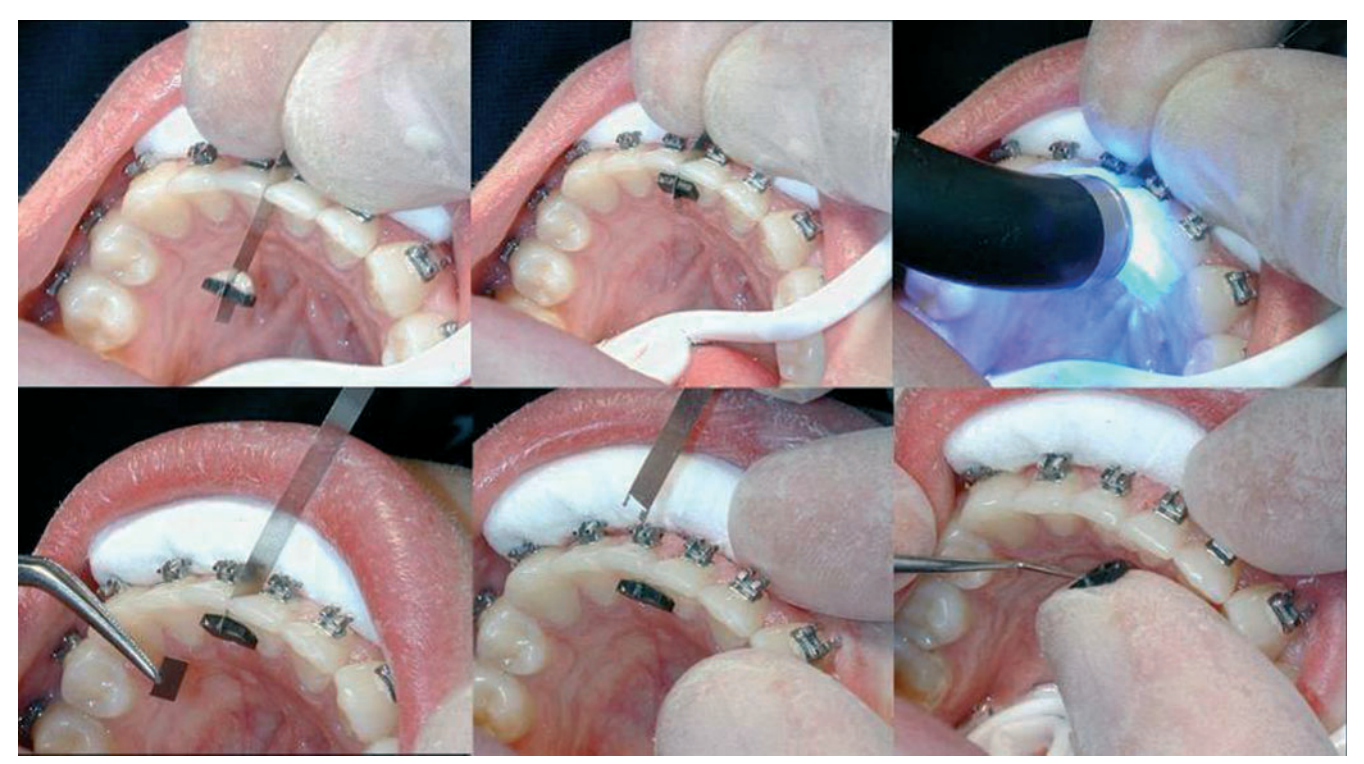
Figure 3 The application strip is guided in between the approximal surfaces of the neighbouring teeth and the LingLock<sup>TM</sup> retainer is brought into tooth contact before the composite is light cured. The application strip is then removed followed by the retention element holder

of the neighbouring teeth. The LingLock<sup>TM</sup> retainer is brought into tooth contact and the guide strip is used to establish the position in superior/inferior direction. A John Nielsen hand instrument is used to make any