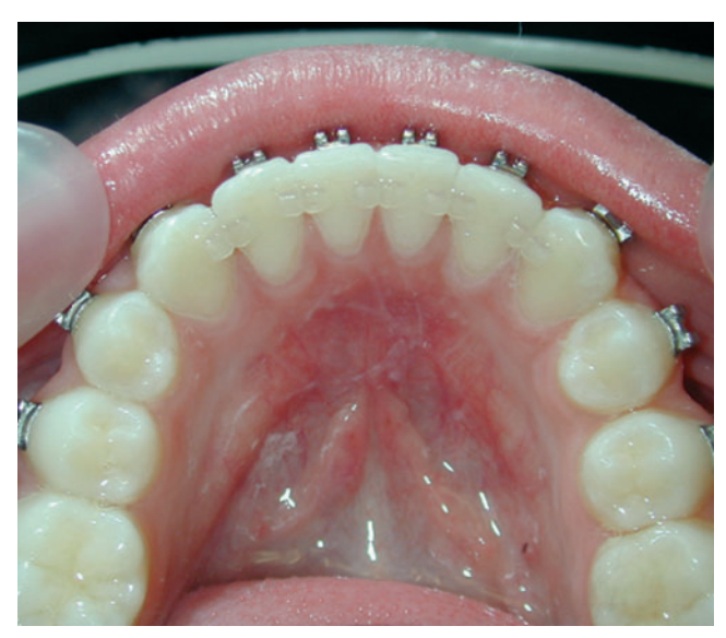
Figure 4 Five sets of LingLock<sup>TM</sup> retainers are needed to replace the standard fixed 3–3 retainer

positional corrections in the horizontal plane and to remove gross excess of composite before light curing. The application strip is removed by pulling it forward and slightly upwards until it breaks distal to the element holder, followed by the removal of the retention element holder (Figure 3).